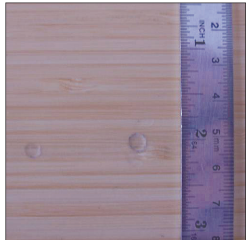
Stiletto heels will indent all timbers and related products

In most cases, appearance is the main consideration on which the selection of flooring species is made. Appearance is influenced by colour, amount of feature, general character, width of the boards, size of the room, direction of lay and the finish applied.